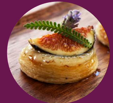
Groom's Room with Gourmet Bites