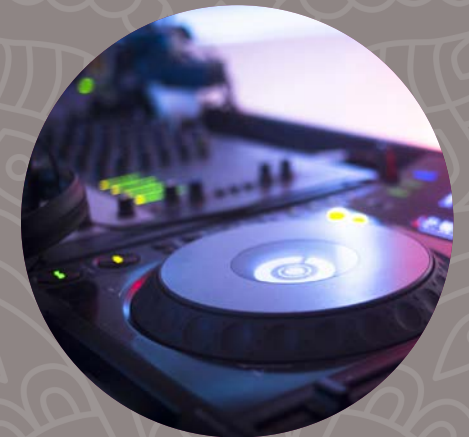
4 Hours of DJ Service