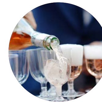
Private International Open Bar Throughout the Reception