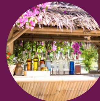
Beverage Station Offering a Selection of Cold, Hibiscus Infused Water, Lime Water, Tea, and Soda Throughout the Ceremony