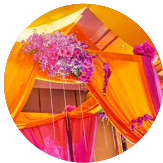
Stunning Stage Area with Colored Backdrop and Seating for Two

Surround Yourself with Luxurious Décor, Delicious Delights, and Exciting Entertainment with Wedding Reception Inclusions