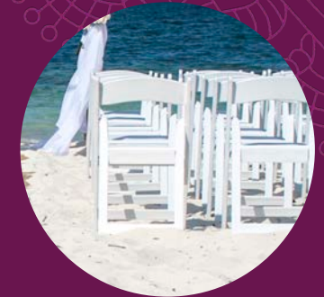
White Avant Garde Uncovered Chairs for Guests