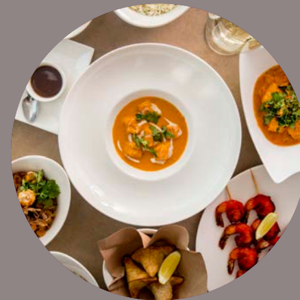
Gourmet South Asian Food Display Prepared by Chef Thushara