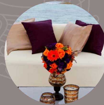
Three Sets of Lounge Furniture