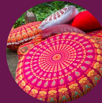
Choice of Pillows or Tiffany Style Chairs for Family Members Participating in the Ceremony