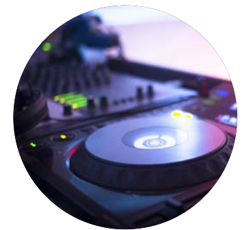
4 Hours of DJ Service

SOUTH ASIAN WEDDING EXPERIENCE BY KARISMA DESTINATION WEDDING