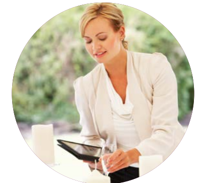
Onsite Signature Wedding Designer™ to Organize and Direct the Processional