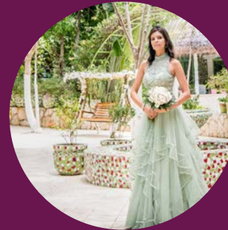
Romantic Ceremony Location