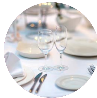
5 Round Tables Decorated and Set for 10 People