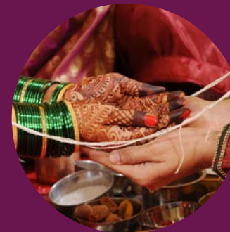
Non-Denominational Minister & Symbolic Wedding Certificate