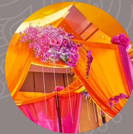
Vibrant Stage Area with Backdrop Draping and Elegant Seating for Two

Make Your Big Day Even More Memorable with These Sangeet Ceremony Inclusions