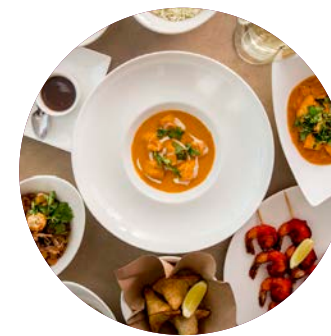
Food Display Expertly Prepared by South Asian Gourmet Chef, Chef Thushara