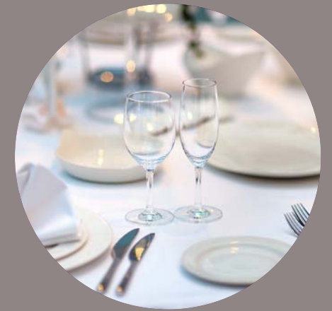
Five Round Tables with White Linens and White Avant Garde Chairs with Coordinating Table Décor