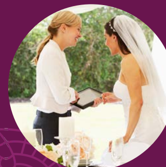
A Dedicated, Onsite Signature Wedding Designer™, Certified in South Asian Weddings