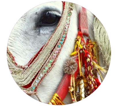
Horse in Traditional Garb for Baraat Processional

The Greatness of Your Love Will Be Honored with These Baraat Procession Inclusions