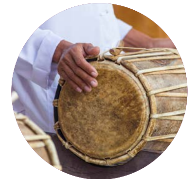
Dhol Drum Player (45 Minutes)