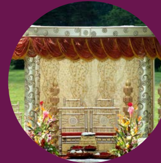
Spectacular Wedding Mandap Decorated with Colorful Backdrop and Draping Sheers