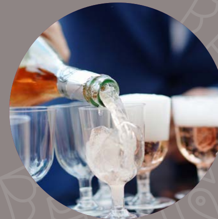
4-Hour International Open Bar