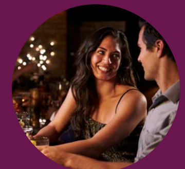
Memorable Moments Honeymoon Package

*Includes all other amenities from the Always & Forever Wedding Package.