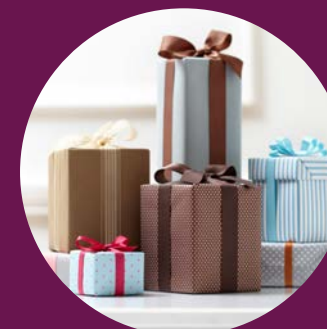
Free Wedding Website & Honeymoon Gift Registry