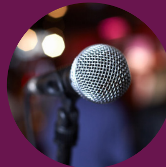
Sound System with Wireless Microphone