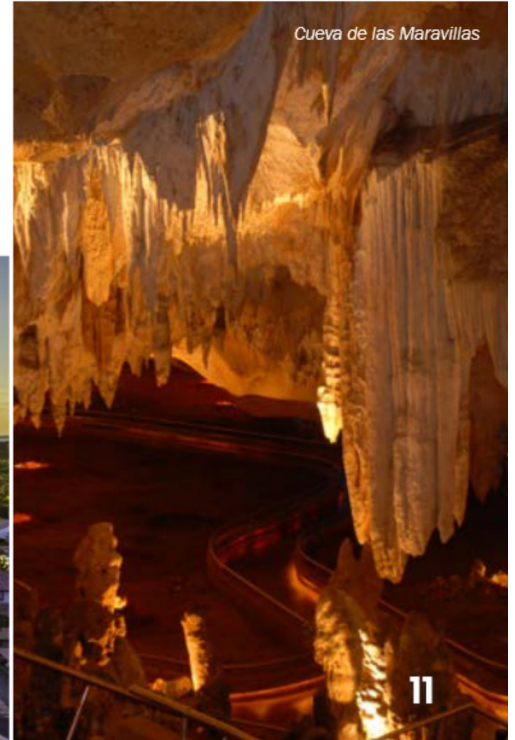
Cueva de las Maravillas