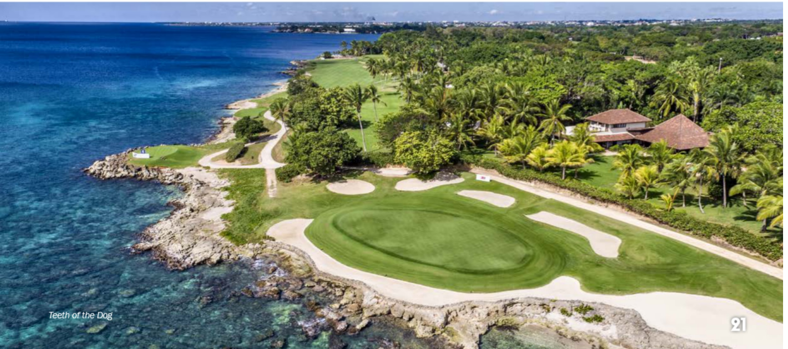
Teeth of the Dog

*This is a private club; you must be accompanied by a member to play.