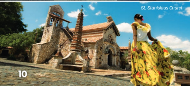
St. Stanislaus Church

ALTOS DE CHAVÓN: La Romana's hidden gem is Altos de Chavón, a replica of a 16th century Mediterranean artists' village that relishes among cobblestone streets, and coral block and terra cotta buildings. Offering magnificent scenic views of the Chavón River, Altos de Chavón was constructed by the imagination of Roberto Copa, a former Paramount Studios set designer, and Charles Bluhdorn, an American industrialist. Today, Altos de Chavón is a cultural center, home to artists' studios, craft workshops and art galleries where hundreds students from around the world compete to enter its intense, two-year programs in Communications Design, Fashion Design and Fine Arts & Illustration. The School of Design is associated with Parsons The New School for Design in New York, where students later migrate to complete their studies. In the heart of the village are a Grecian-style amphitheater and the Church of St. Stanislaus. www.casadecampo.com.do