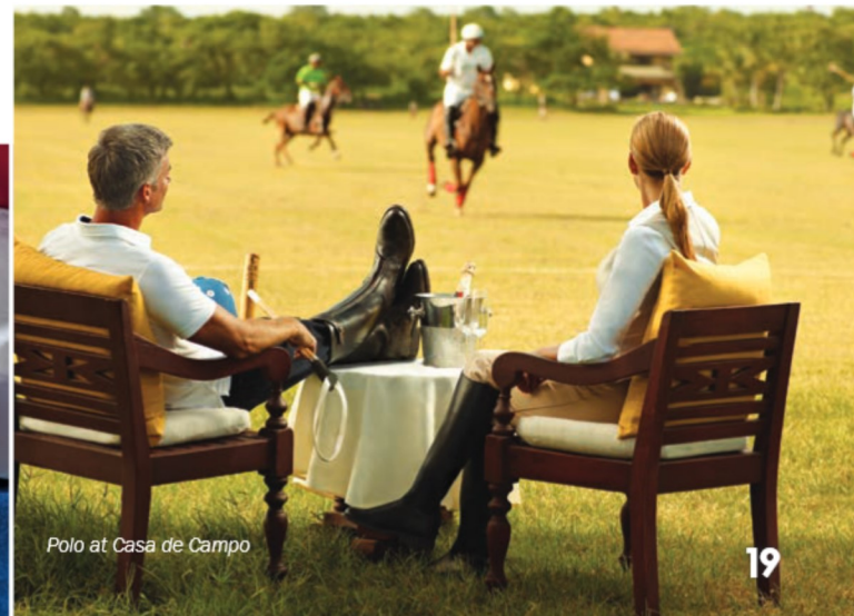
Polo at Casa de Campo