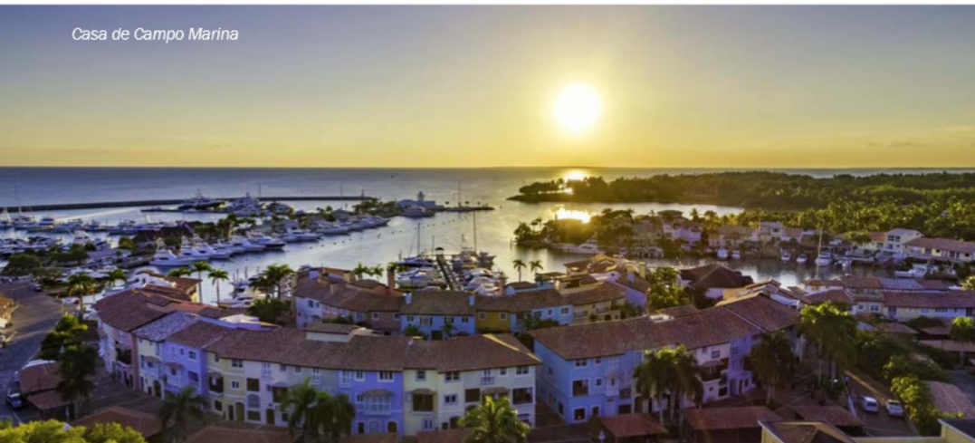
Casa de Campo Marina