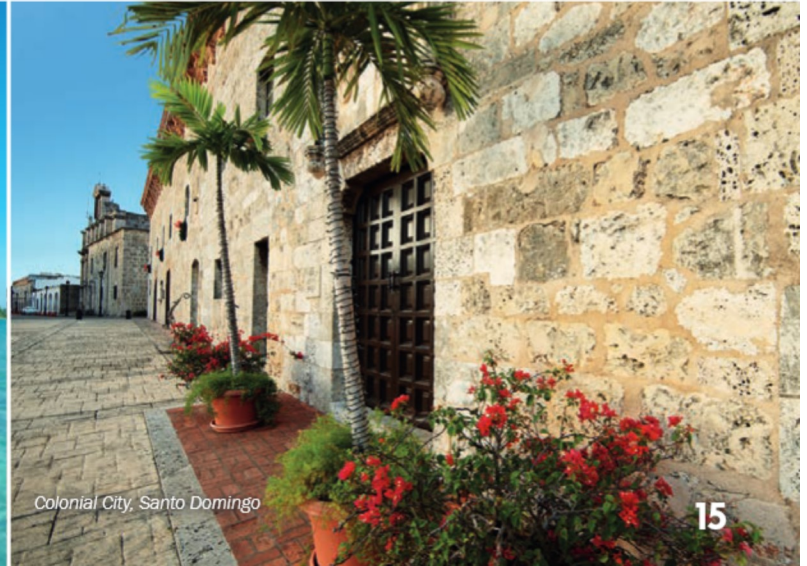
Colonial City, Santo Domingo