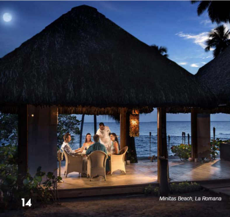
Minitas Beach, La Romana