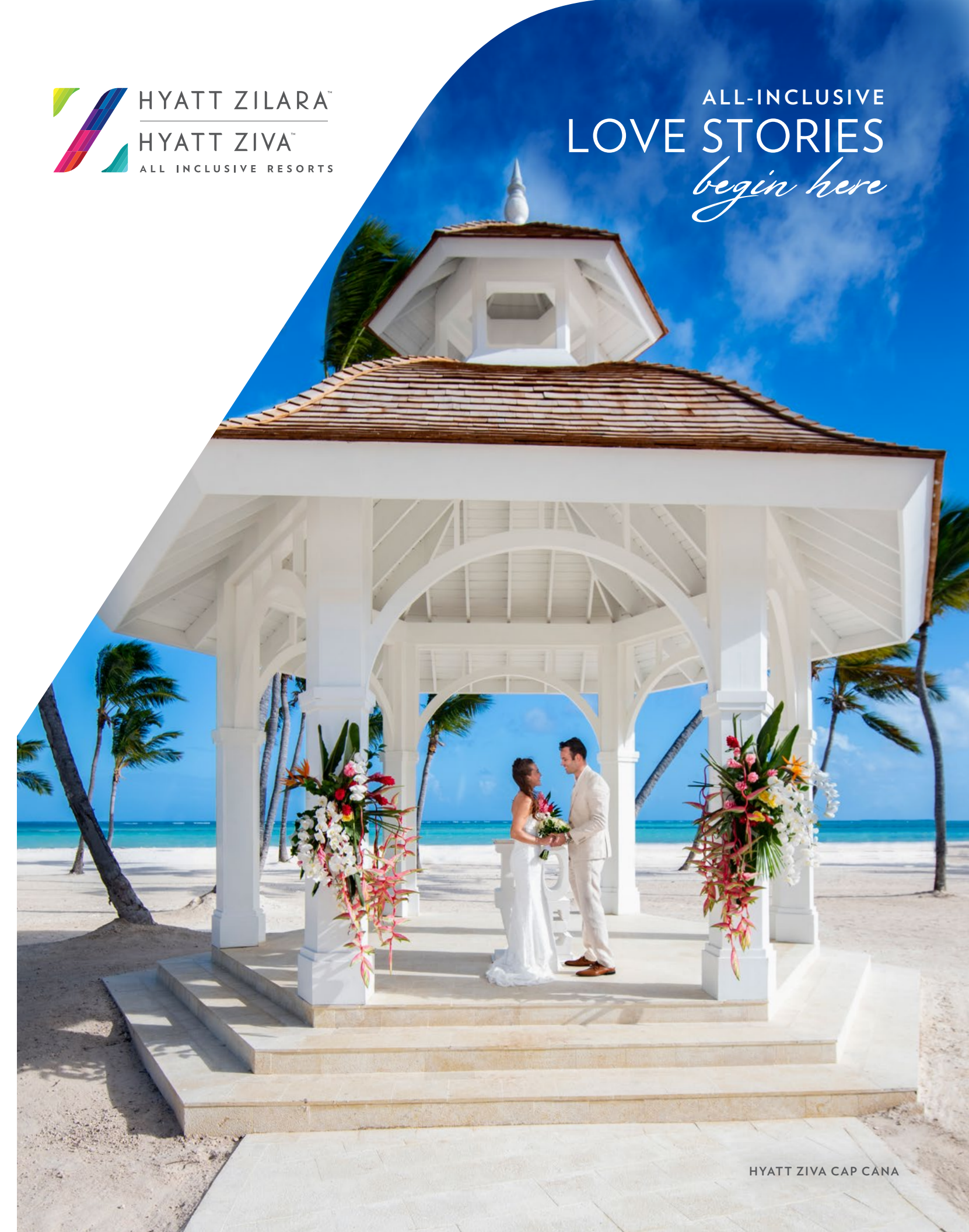
HYATT ZIVA CAP CANA