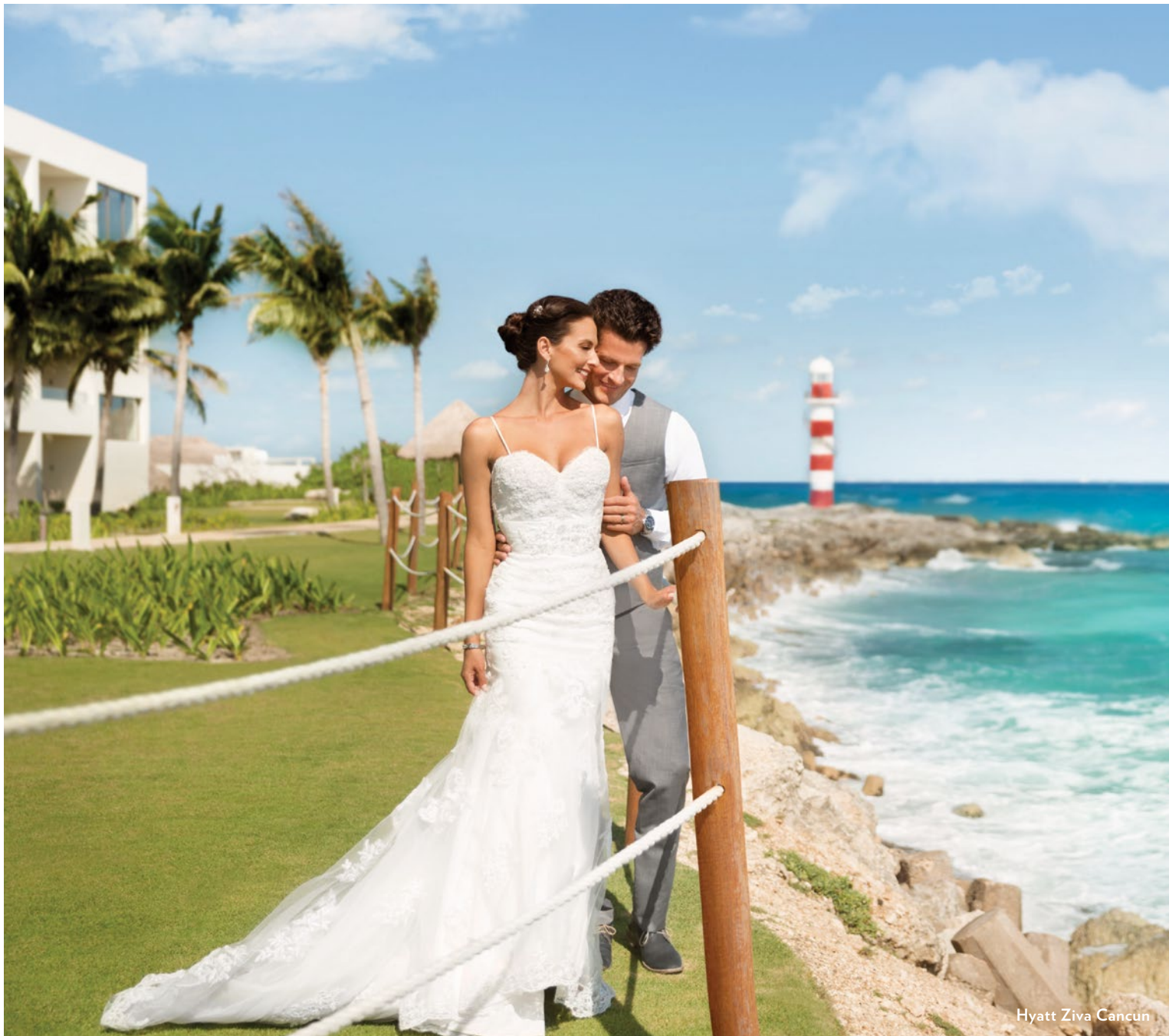
Hyatt Ziva Cancun