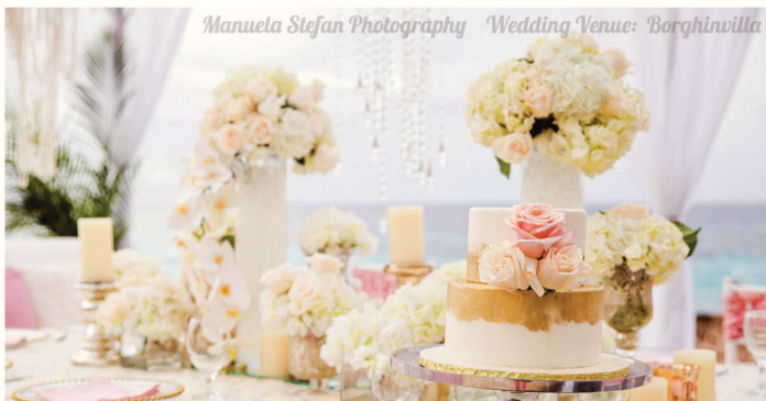
Wedding Venue: Borghinvilla www.borghinvilla.com info@borghinvilla.com

Jamaica is well suited for couples seeking adventure along with their nuptials and honeymoon. With more attractions than any other English-speaking Caribbean island, Jamaica boasts natural wonders such as Dunn's River Falls, Fern Gully in Ocho Rios, bamboo rafting on the Martha Brae and mountain biking in the Blue Mountains. Couples can also go off the road with ATVs through adventure outfitters, including Island Routes Adventures and Chukka Caribbean Adventures, or horseback riding in the ocean. They can also explore the island on a romantic catamaran sunset cruise or fly through the forest on Mystic Mountain's heart-pumping bobsled mountain ride and canopy zip-line tour.