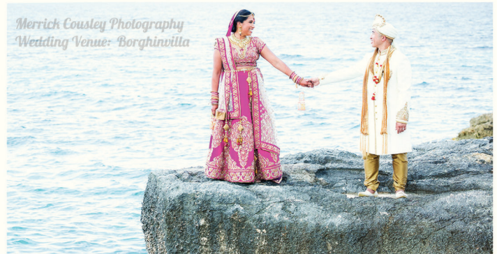
Wedding Venue: Borghinvilla

Jamaica is often ranked as one of the top places for weddings and honeymoons. This can be credited to the hassle-free wedding approach coupled with the island’s beauty. Jamaica is also easy to get to, with flights from most major international gateways and across Canada.