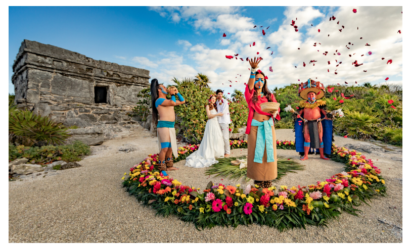
Mayan Ruins ($)