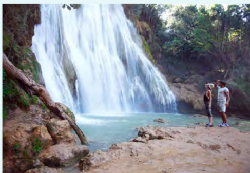
Waterfall “El Limón”.

brought in parts from England, also includes a visit to the Whale Museum.