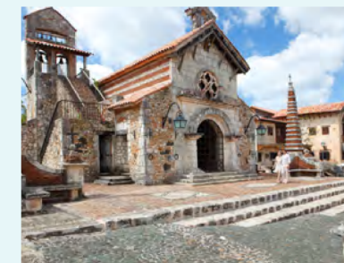
Altos de Chavón.

Cigar Tasting Basics: Is a tour where you are invited to the world of cigars offered by the García Cigar Factory, one of the most interesting cigar factories in the world, where you will see step by step the harvest process of the leaves, its classification, blending and aging until converting in cigars “Premiums” handmade. You will end the day with a cup of coffee and tasting 4 cigars of different strengths. They have another tour that does not include the tasting of cigars.