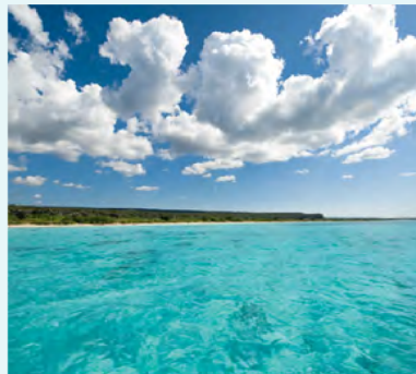
Playa Bahía de las Águilas.

Cachote (Biosphere Reserve): On a safari jeep you can explore the Eastern part of the National Park “Sierra de Bahoruco” and the area of “Cachote”, a cloudy forest with rich eco-tourism, and delight yourself with an extraordinary panoramic view, walk