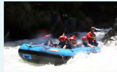
Rafting at Jarabacoa.

“Cofresí, Maimón, Palo Indio, and El Toro” and many others, where you will appreciate the most diverse variety species of the flora and share with local families.