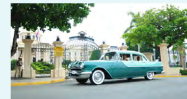
The Goat route.

The National Zoo and the Botanical Garden: Is as very interesting tour where you will see the great variety of the Dominican flora; and at the Zoo you will see the different species of the national fauna.