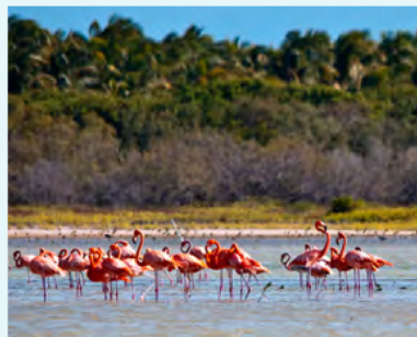
Laguna de Oviedo.

the trails and enjoy a comfortable temperature.