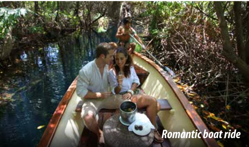
Romantic boat ride