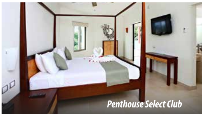
Penthouse Select Club