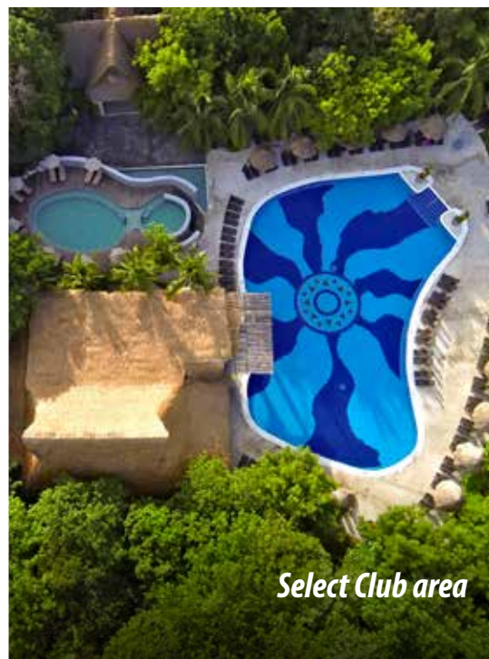
Select Club area