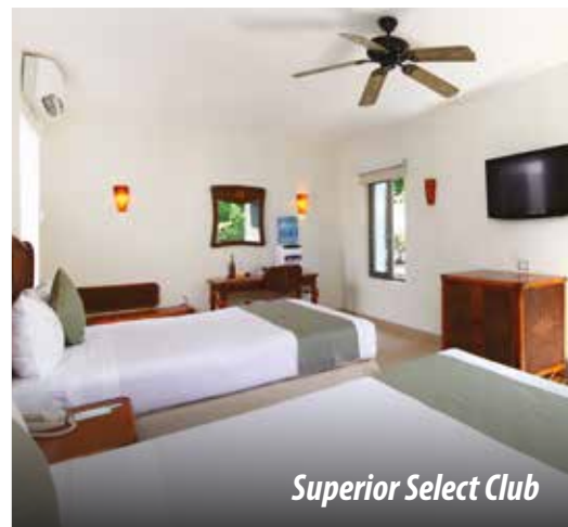
Superior Select Club